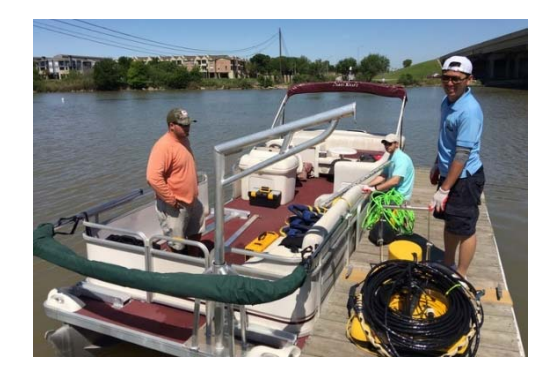
Figure 4. University of Houston R/V Mishepeshu which will be used for launching ozonesondes in Galveston Bay.