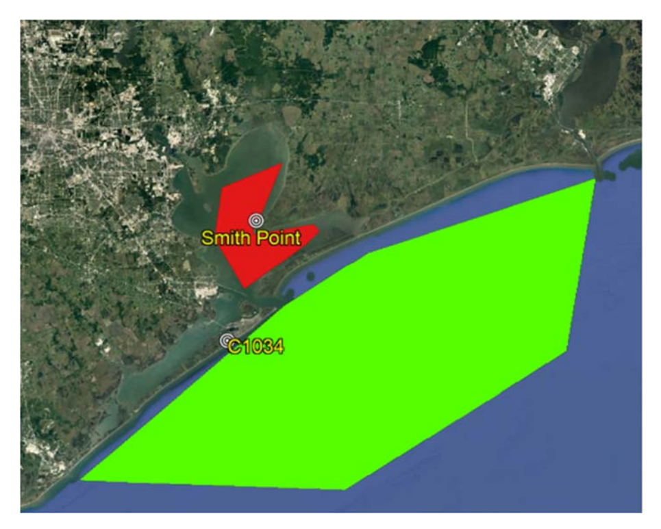
Figure 2. Map showing routine sampling areas for Larry Willis (red) and the Merchant Vessel (M/V) Red Eagle (green).